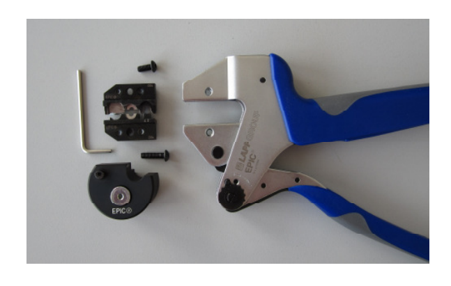
Crimping tool individual parts