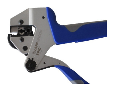
Crimping tool CSC assembled

Crimping tool (11147000) with crimping insert (e.g. 44428995) and locator (44428996) to crimp \mathsf{EPIC}^{\$} SOLAR contacts.